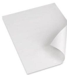
flat / even