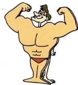
strong / sturdy