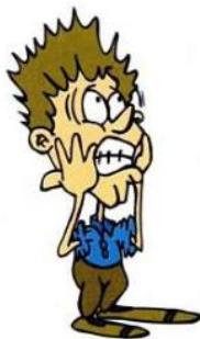
scared / petrified