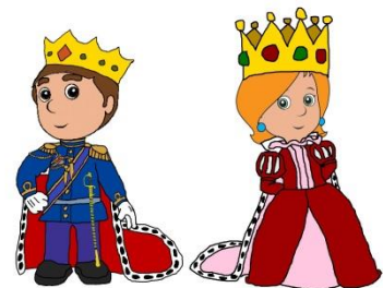
rich / opulent