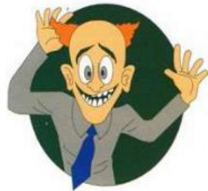
foolish / insane