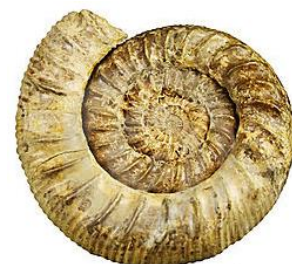
ancient / antique