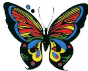
colourful / vibrant