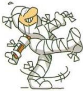
injured / wounded

Children are encouraged to use adjectives in their writing to make them more interesting for the reader. It is very common for children to forget to include adjectives and they often need reminding to stop and think about what a character looks like or feels or how they might describe the setting of their story. We hope that brainstorming with their family, will make the use of adjectives memorable so they always include them in their writing.