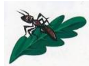
tiny / miniature